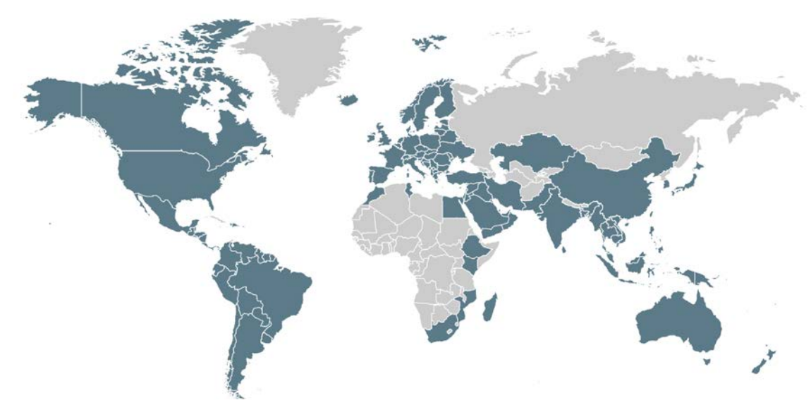
*Map indicates distribution locations

G-III's fashion footprint extends globally across all facets of our business. We distribute our products with more than 1,200 retailer partners and through our own channels internationally. We source and manufacture with partners across several geographies and leverage global expertise to create high-quality products. And, we have corporate offices in eight countries.